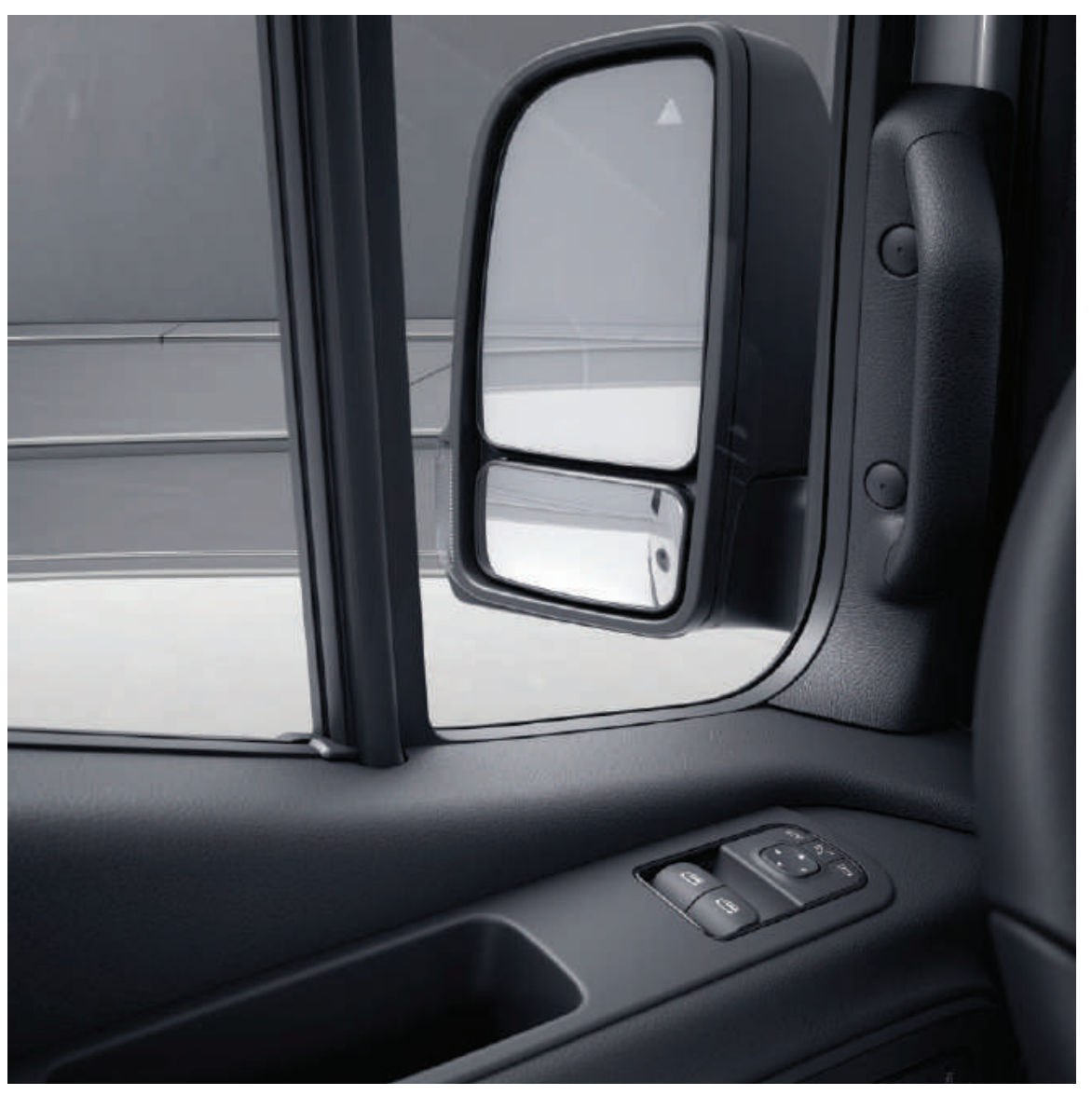
Exterior mirror heated and electric adjustable