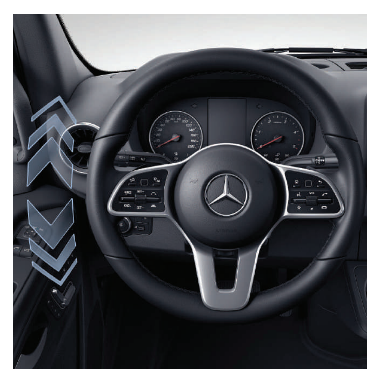
Height and rake adjustable steering wheel