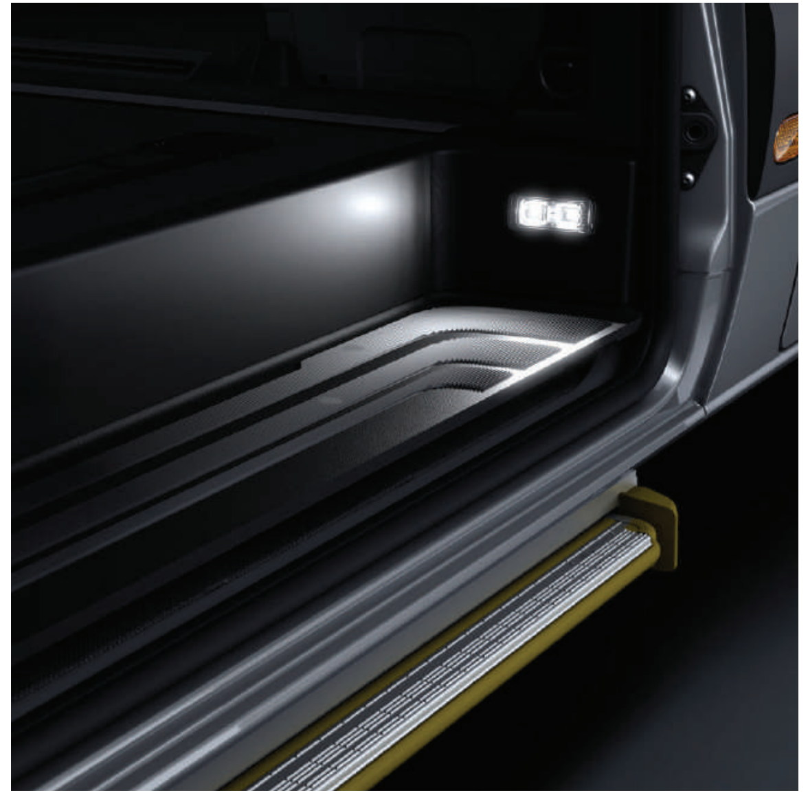
Electrical operation of step load, left